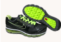
Air Jordan Retro 5 V Shoes A15 black white red ID:5226 Free Shipping